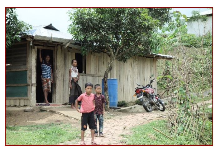
Tribal Family in Chittagong Hill Tracts

The BTABC has a second committee overseeing an additional program in southeast Bangladesh. This program is longstanding and involves loans given to families and individuals in communities throughout the Chittagong Hill Tracts. The family pictured here initially took an agricultural loan through FARMS. Their earnings allowed them to invest in a motorcycle. They are able to generate income by renting out the motorcycle to others in need of temporary transportation. In this way, the family not only earns an income but also provides a valuable resource to the community.