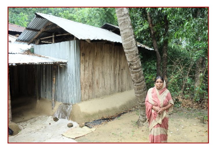
Bengali Lady Operates Fishery

Families in this area receive loans for a variety of businesses. One man received a FARMS loan for a wood carving business which employs four people. Another community member, the woman pictured below, received a FARMS loan to operate a fishery. The building you see is her home and the fishery is nearby. The FARMS committee reverently talked about her strong faith and said that she is a light to her Hindu neighbors who live just a few feet away from her home. Through FARMS, individuals and families in places such as this are not only able to provide for their own physical needs, but expand their ministry outward into their community. We are thankful for the work of the Lord in Bangladesh!