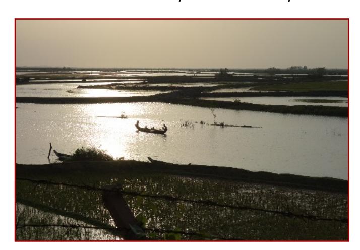
Sunset in Bangladesh

Bangladesh is a great example of the grassroots model in action. FARMS recently began a new program in the Tribal region of the Chittagong Hill Tracts. While it still holds to the principles of FARMS, it is a unique application tailored to the needs of the region. The program is in partnership with the Bangladesh Tribal Association of Baptists Churches, BTABC. They are using it to strengthen their Ministry Centers which serve an important role in ministry to their tribal communities.