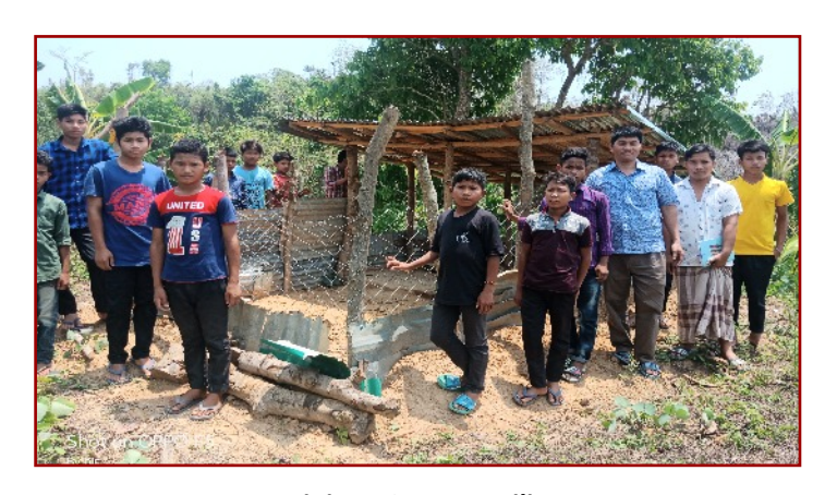
Ministry Center Facility

In the Chittagong Hill Tracts, there is a very high rate of illiteracy. This, paired with extreme poverty and isolation, creates many hardships. These issues make it difficult for tribal groups to participate in the economic opportunities with the Bengali majority. Because of the illiteracy rate, tribal members also enter into poor contracts with Bengalis, resulting in a loss of ownership of their land. For this reason, educating the tribal youth is incredibly important. The BTABC oversees 8 ministry centers focusing on doing just that. At these centers, youth from ages 10-18 receive an